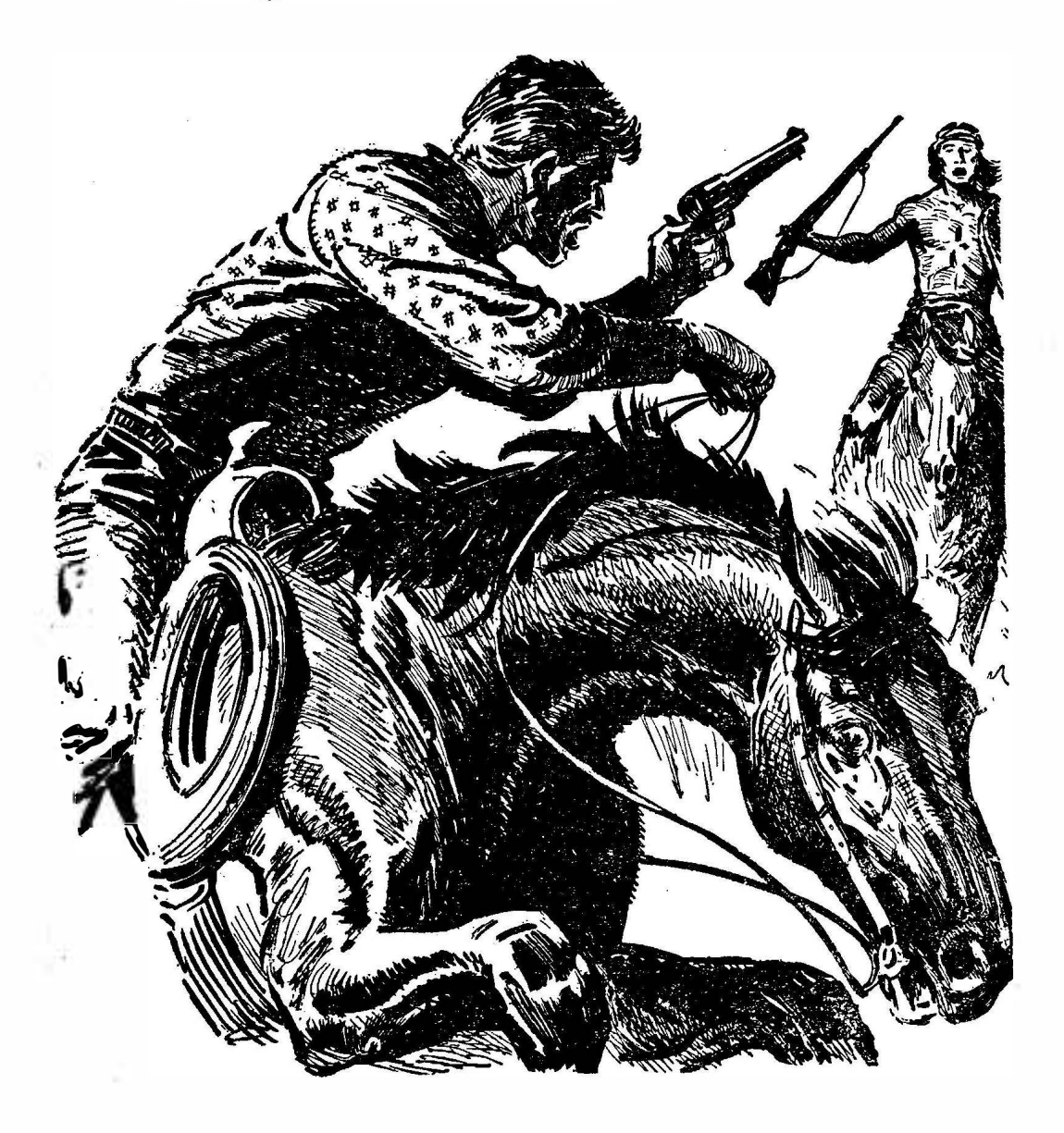
The half-pint had to prove, come hell or Chiricahua, that he could swing a jug, a gun—or a girl—with any man!